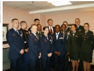
2006 NDIA SCHOLARSHIP WINNERS