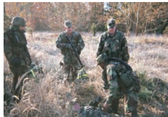
CDT HUNT DEMONSTRATES TREATING A CASUALTY ON THE BATTLEFIELD