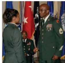
A PROUD FATHER PREPARES TO RENDER THE FIRST SALUTE