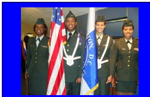
Bison Color Guard Standing Tall at the 2008 Convocation

C/2LT Hopewell were among guests at the Paralyzed Veteran Banquet