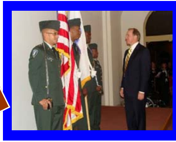
Bison Color Guard Team at the GW Chapter Luncheon