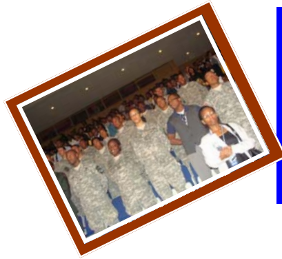
Army ROTC Cadets represented at the 141st Howard University Convocation

More Bison in action Photos in our album at http://www.coas.howard.edu/departments/#army