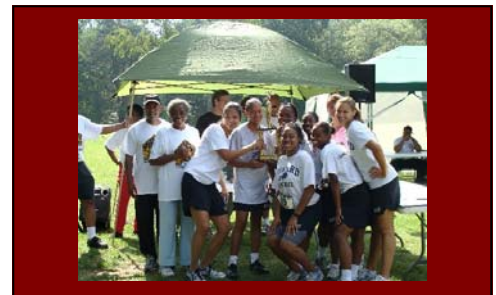
Bison women's Team takes 1st Place at the Rocks Inc. 5 miler