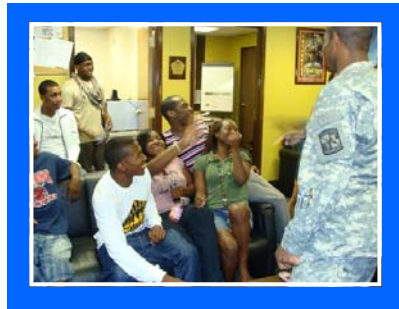
2008 Cadet Social