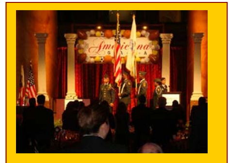
Bison Color Guards at the Paralyzed Veterans of America Banquet