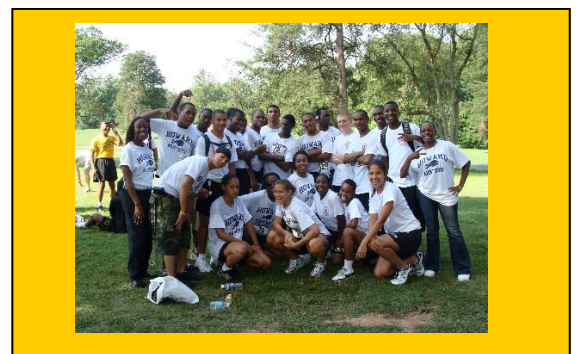
Members of the ROTC Company 220193 5-miler and support team