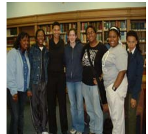
Dr. Danielle Allen, the inaugural Frank Snowden Jr. Lecture speaker, and a group of Howard Classics students.